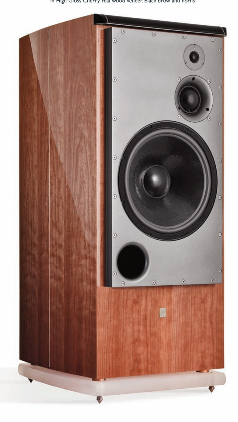
SCMI50SE in High Gloss Cherry real wood veneer. Black brow and horns