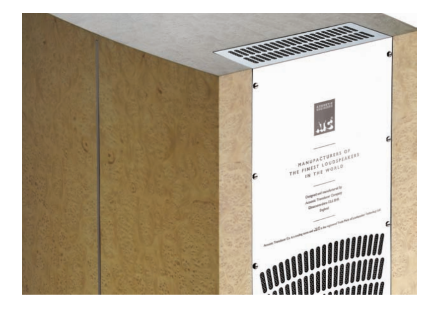
Special Edition fine acid etched and PVD dull nickel coated rear venting and input panels each indivdually numbered