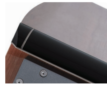
Exclusive top brow detail available in various finish and colour combinations